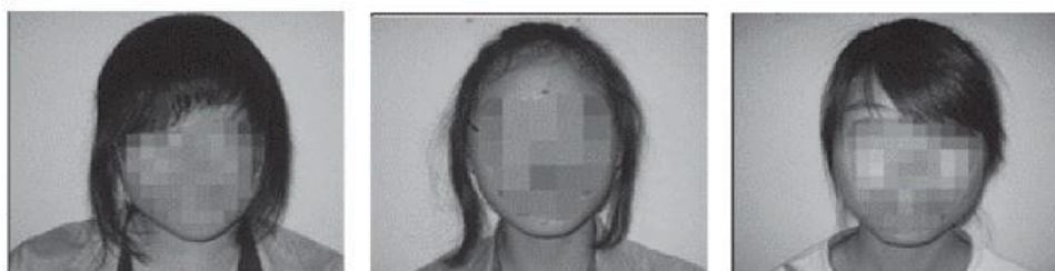
Sample of hairstyles (for girls) not allowed in the school. Fringes must be neatly clipped up (including those at the side of the forehead) - refer to page 17 for the standard hairstyle for girls.