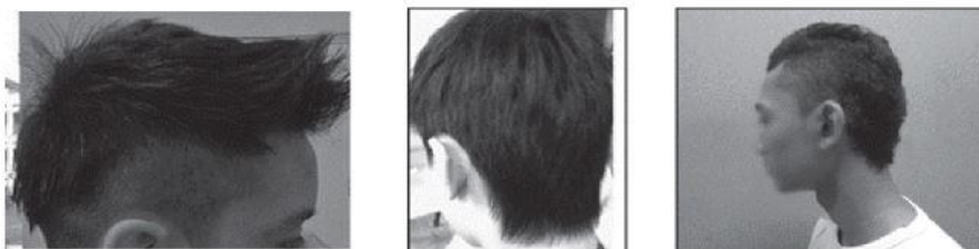
Sample of hairstyles not allowed in school include layered haircut and shaving only the sides (leaving the back portion longer).