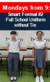
Smart Formal #2 Full School Uniform without Tie