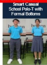
Smart Casual School Polo-T with Formal Bottoms