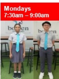
Smart Formal #1 Full School Uniform with Tie

Overview of 2026 Attire and Uniform. Be well-groomed, every day.