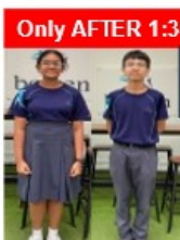
Half-Uniform School PE T-Shirt with Formal Bottoms